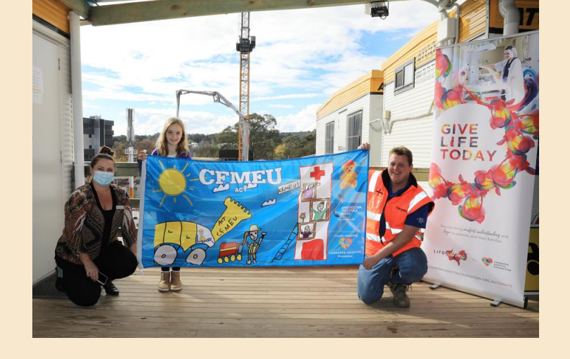
CFMEU ACT has raised $10,000 to support children in hospital! Thank you.