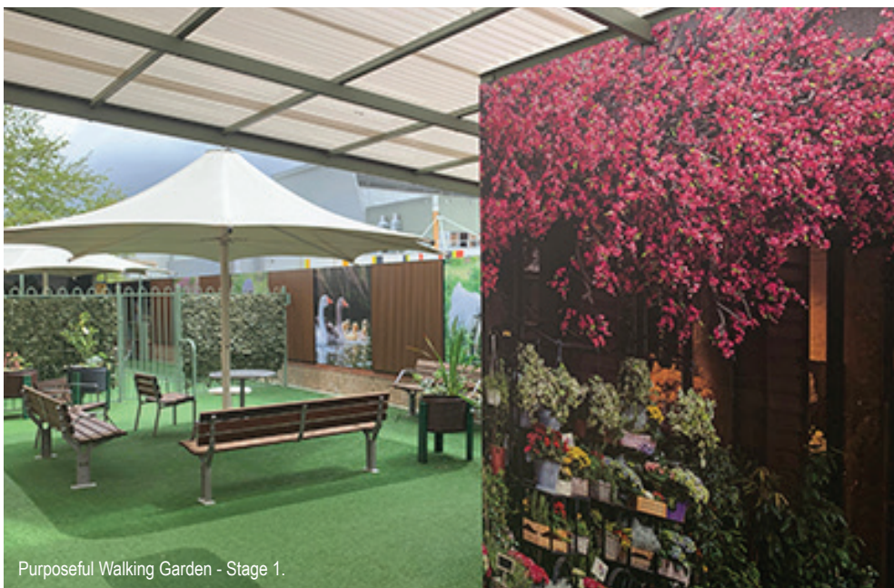
Purposeful Walking Garden - Stage 1.