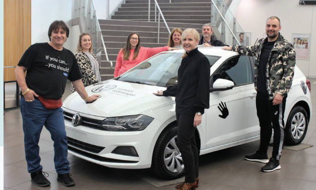
Top fundraisers in Tiny's Car Challenge will get the chance to win this car!

The added impact of a health pandemic makes healing harder, both for patients and their families. Measures to protect vulnerable patients reduce