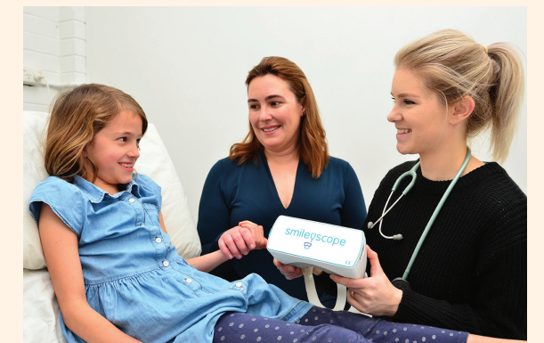
Smileyscopes will make needle procedures a little less scary for paediatric patients

Smileyscopes offer a wearable virtual reality experience for children who are undergoing needle procedures. Needles can cause a lot of anxiety for patients and this anxiety can increase the pain and suffering associated with treatment, as well as cause distress for parents and caregivers. Giving children a fun, colourful, and interactive virtual reality experience will be a great distraction, ultimately enhancing their hospital experience, while making work more streamlined for medical practitioners. Thank you to Coles and Canberra shoppers for supporting this initiative!