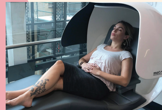
The state-of-the-art sleep pods in the CRCC

Funds raised through Dry July support an array of initiatives at the Canberra Region Cancer Centre. The Therapeutic Harp Program is one such service that is supported annually, and thanks to funds raised last year, the CRCC was equipped with two Sleep Pods. Many patients who come to the CRCC travel from interstate, so the addition of the sleep pods gives these patients the opportunity to relax and unwind in between appointments. There is still time to donate to the Canberra Hospital Foundation's Dry July, help us to "fill our cup"!