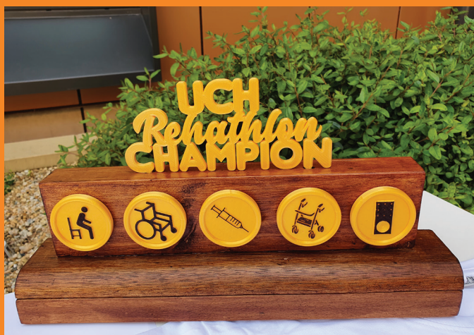
The coveted trophy.

The race that stops a nation came early to Canberra this year with the inaugural UCH CAN GIVE DAY Rehathon held in the central courtyard.