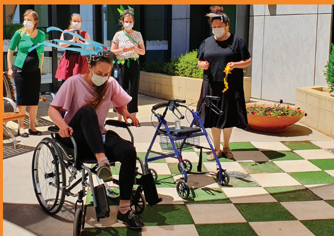
The wheelchair leg was a favourite with competitors.

A small but talented group took part in the mask decorating competition, with the one and only Leo Sayer (CHF Ambassador) lending his eye for talent to the judging.