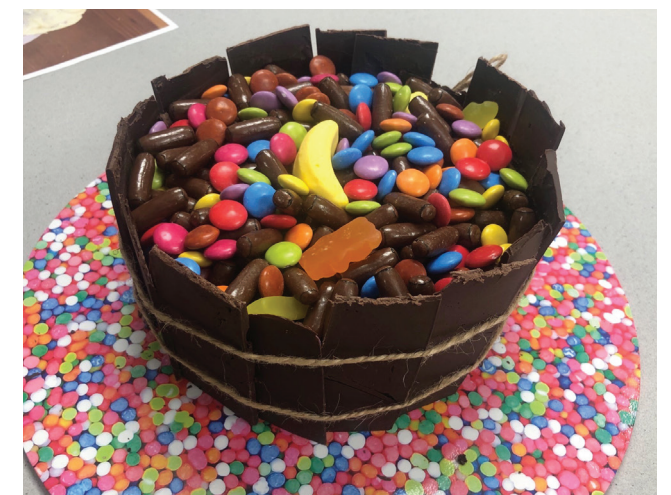
Chocolate mud cake by Cathie O'Neill