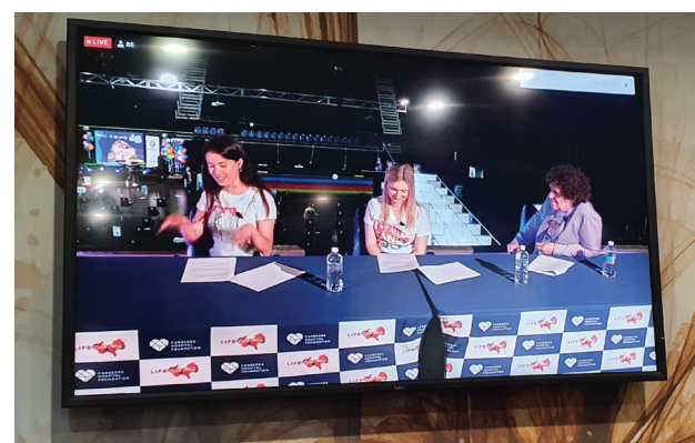
Livestream of the judging desk.