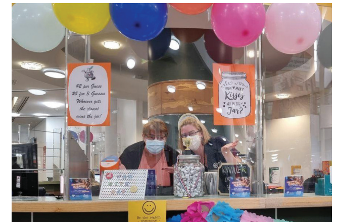
The Canberra Hospital Information Hub team.

Even our testing and vaccination centres joined in with dress up and costumes, bringing the celebration to the community.