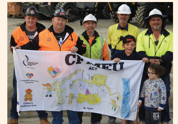
Xavier's winning flag design.

And a big shout out to runner up Noa! The CFMEU loved your design too and hope you enjoy your gift voucher prizes!